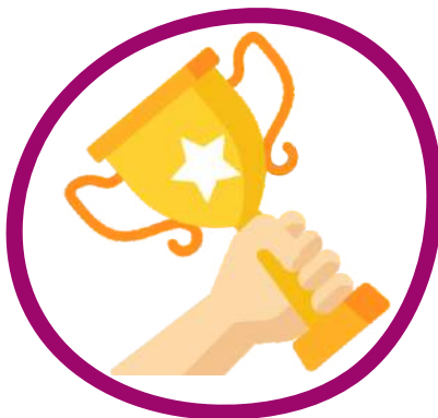
Renowned Trust in Educational Field