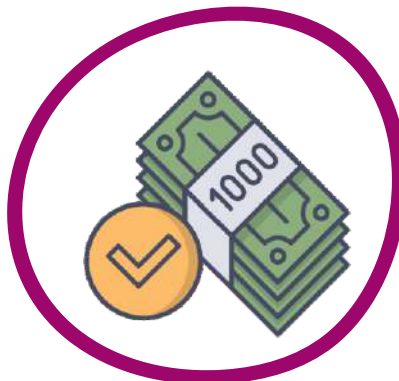
10,000/- Nomination Fees