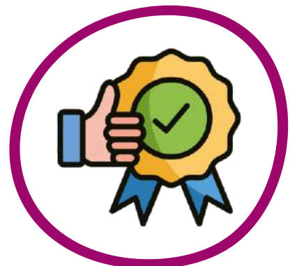
35 Winners from all over India