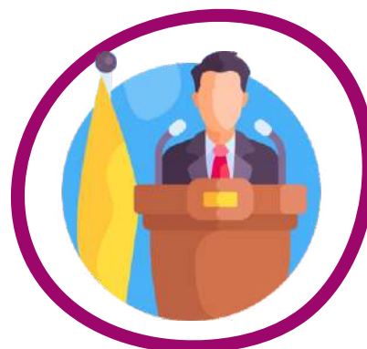
Award distribution by national-level VIPs and social personalities