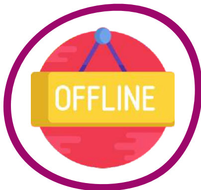
Offline Application Process