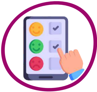
Transparent Selection Process