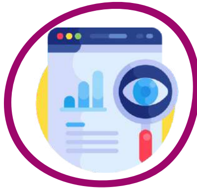
Digital Records Management