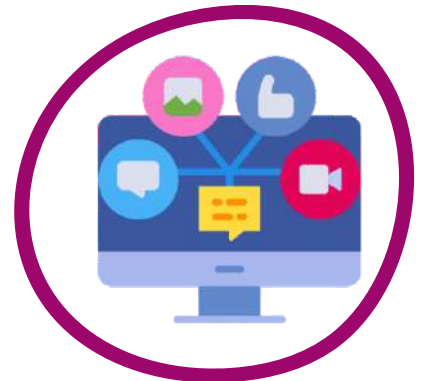
Online Nomination Process